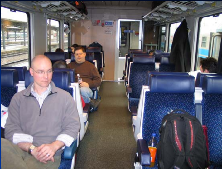
On train, Budapest to Vienna