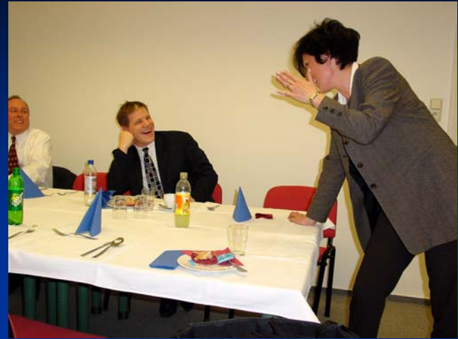
Informal discussion, Budapest