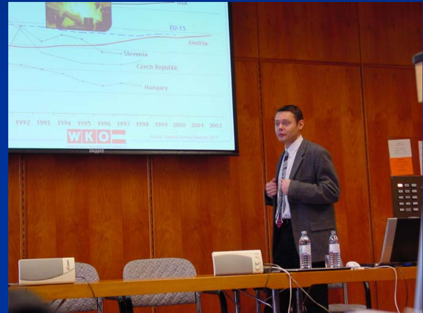
Meetings at Trigranit Development Co., Budapest, and Austrian Economic Chamber, Vienna