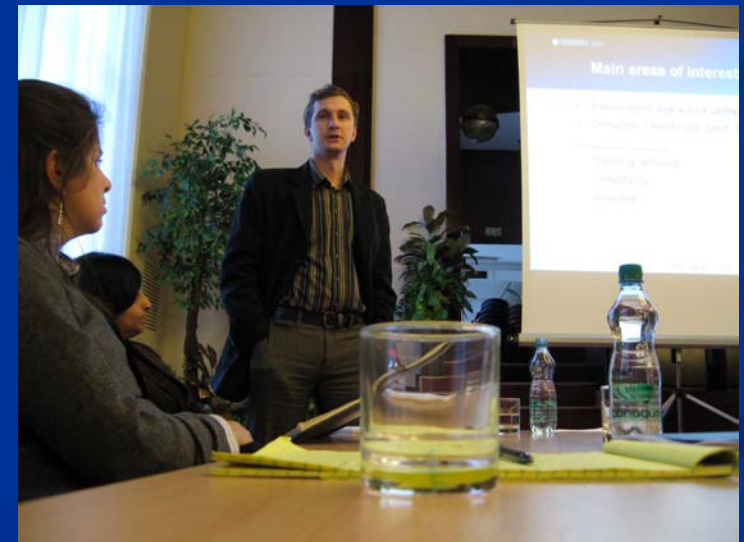
Transparency International, Prague (Anti-corruption agency)