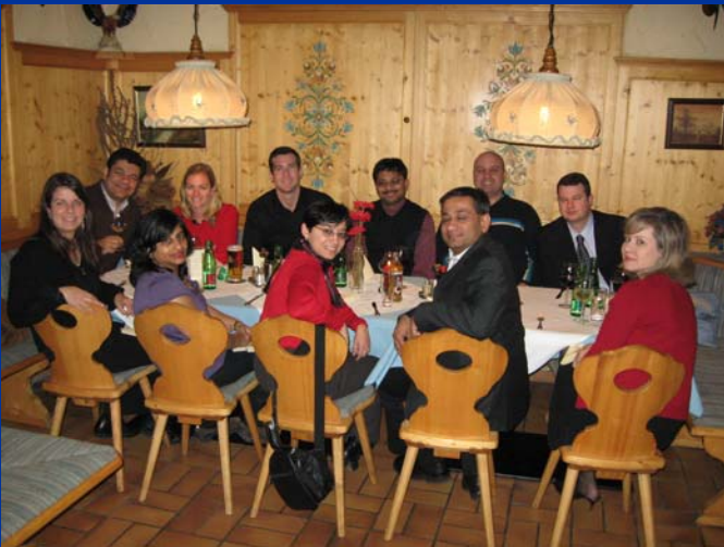
Non-working dinner, Vienna