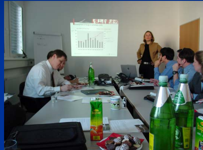
Biotech R&D company, Vienna