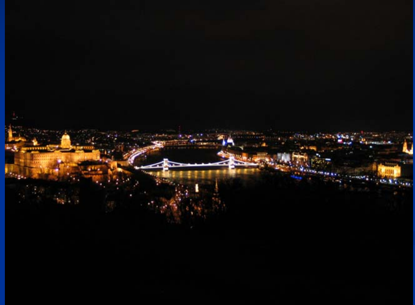
Budapest at night