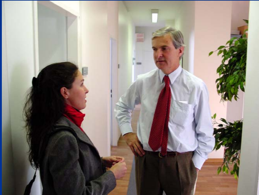
UD student talking with president of small Austrian manufacturing company