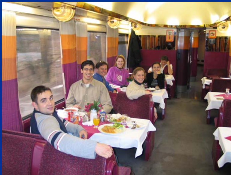
Dining on train, Prague to Budapest