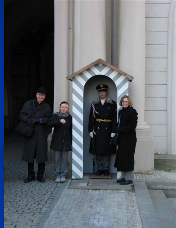
With the guards at Prague Castle