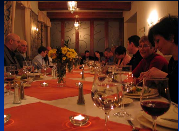
Dinner discussion with restaurant owner, Budapest