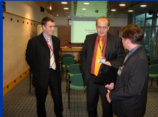
Talking with executives at Hungarian info. tech. company