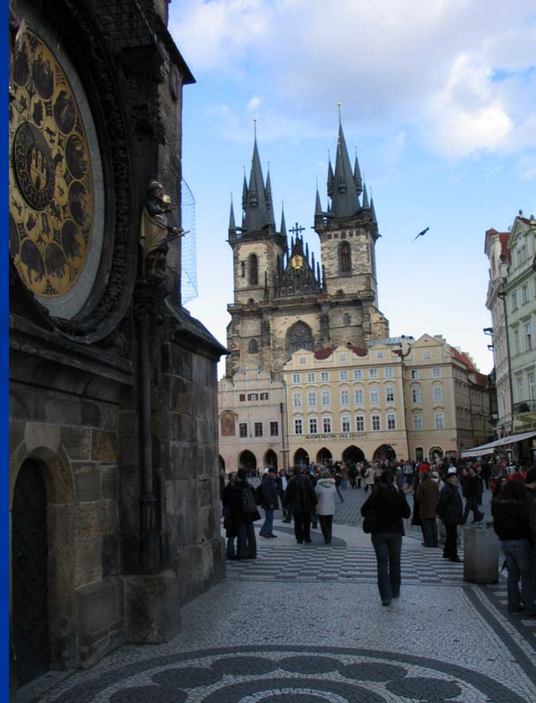
Prague Old Town