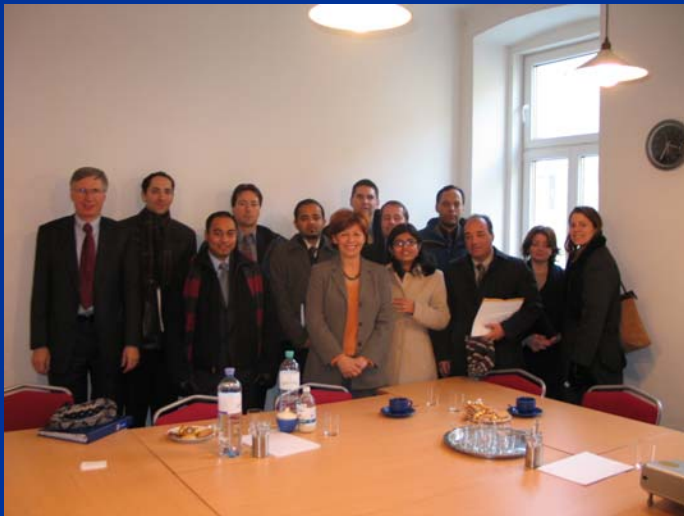
Pharmaceutical marketing business, Vienna