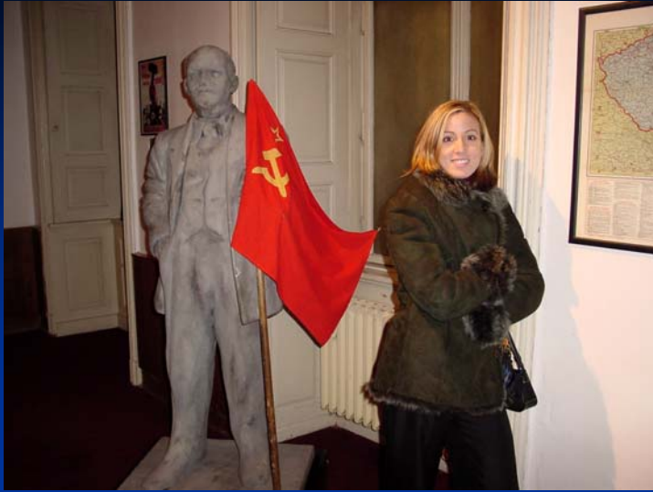
With Lenin at Museum of Communism, Prague