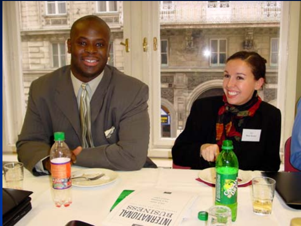
Working lunch, Budapest