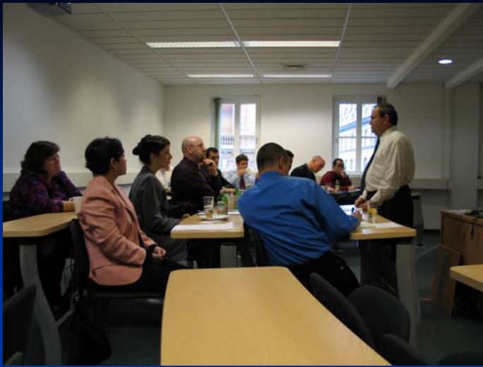
Discussion, Central European Univ., Budapest