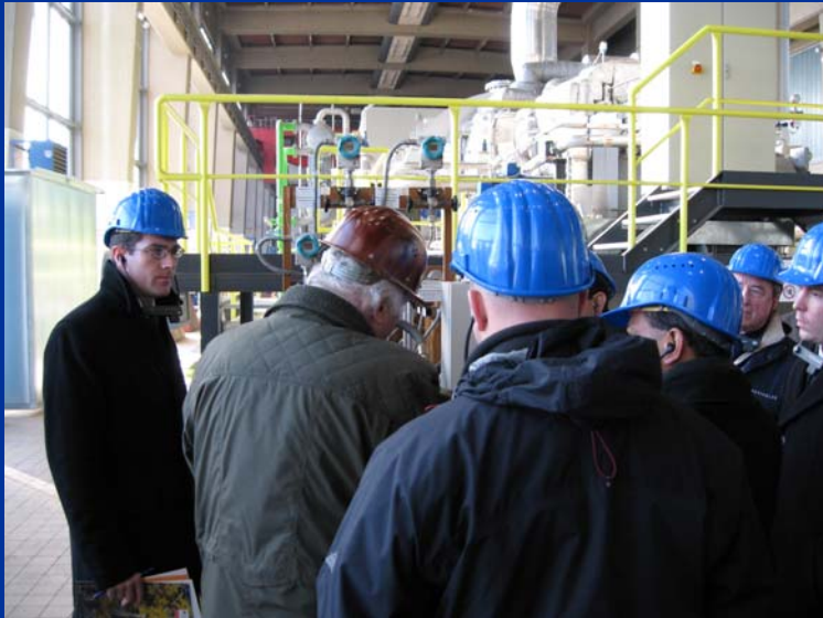
Biomass electrical generation company, Vienna